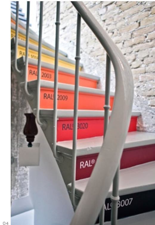
04 Up to the second floor, the stairs display the colours of the RAL chart. First, the stairs were painted, then the RAL references were applied using digital printing on adhesive.

The spirit of recycling has also guided the design of the kitchen, where alimentary glass jars serve as ceiling lamps, and old pine panelling has been stripped, painted and used to cover IKEA storage units, decorated with random buttons to add a touch of humour.