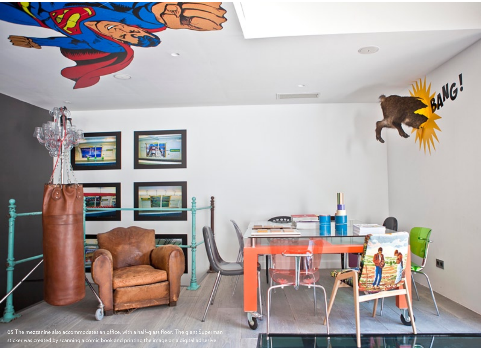
05 The mezzanine also accommodates an office, with a half-glass floor. The giant Superman sticker was created by scanning a comic book and printing the image on a digital adhesive.